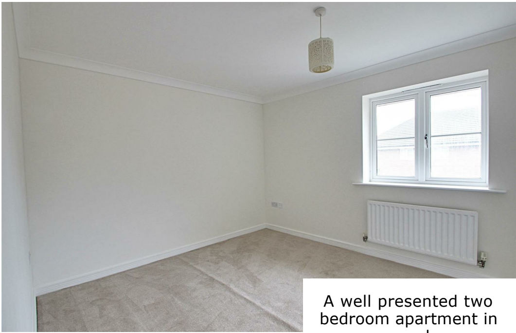
A well presented two bedroom apartment in a popular development.